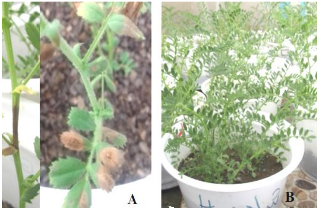
شکل ۱. A. نشانه‌های بیماری سوختگی پس از تلقیح Didymella rabiei روی گیاه نخود، B. شاهد سالم.